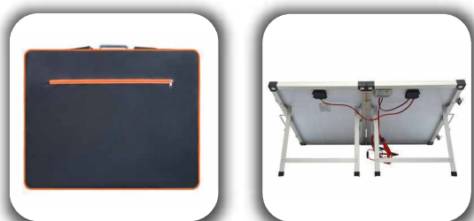
— product details —