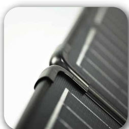
— product details —