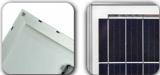
— Product details —