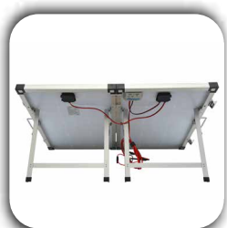
— product details —