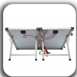
— product details —