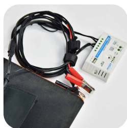
— Product details —